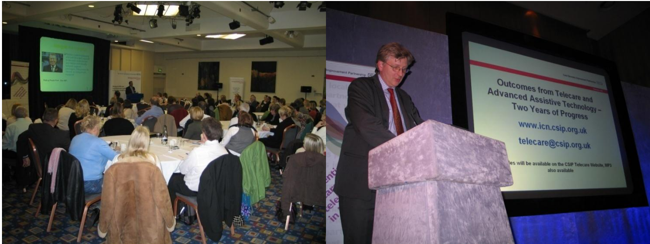
Birmingham Telecare event

A Total of 440 people attended the recent five CSIP telecare events in London, Leeds, Manchester, Birmingham and Taunton. The delegates came from a wide range of service areas across health, housing, social care, third sector, independent and commercial sectors. It was good to see the increasing amount of interest from health trusts and commissioners.